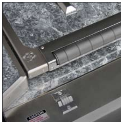
Rear power extend table opens and closes with the push of a button on the rear loading door frame.