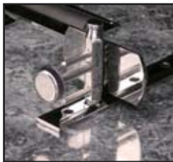
Bier Pin fully open.