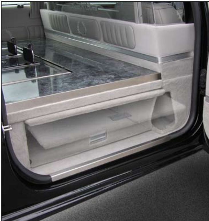
Extra-large storage compartment under partition with lid.