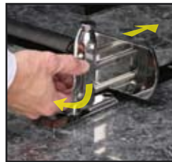
Tighten the quick-adjust knob to secure the casket or Commemorative Carriage in place.