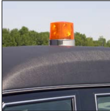
An optional beacon ray light as pictured, or wiring for a customer's light can be installed, if requested.