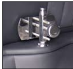
...it can be conveniently stored on the top of the wheelhouse panel.