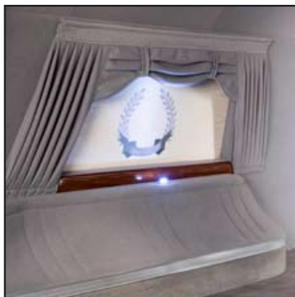
Stylized wheelhouse panels, with brushed aluminum accent moldings, are shaped to yield more floor space to carry additional flowers.