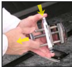
Depressing the top button releases the tightening knob and shaft to fully open the Bier Pin.