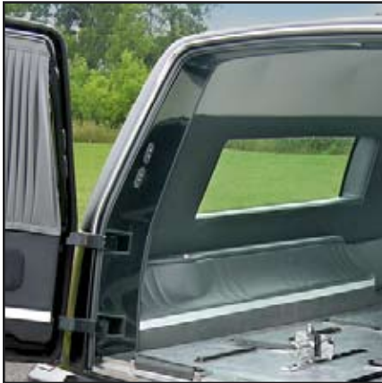
An oval or limousine-style window can add an additional touch of elegance. An example of the interior is shown in the photo directly above and the exterior of the window can be seen on the vehicle on the cover of this brochure.