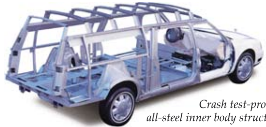
Crash test-proven, all-steel inner body structure.