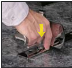
Place the Bier Pin in one of the hexagonally-shaped holes.