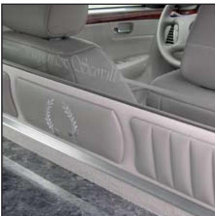
Leather interior in driver's compartment on the base Cadillac chassis is accented by matching material and trim in the rear compartment.