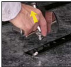
Grasp and pull the Bier Pin straight up from its seated position and...