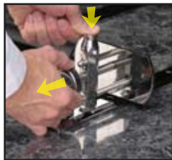
To release, simply push the top button as before, and pull the knob to open the pin.