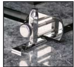
Bier Pin in position.