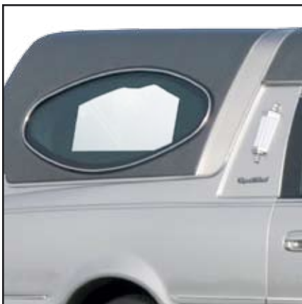
Optional oval window and chrome band.