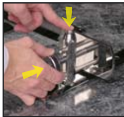
Depress the top button and push the knob until the bier plate is close to the casket or Commemorative Carriage.